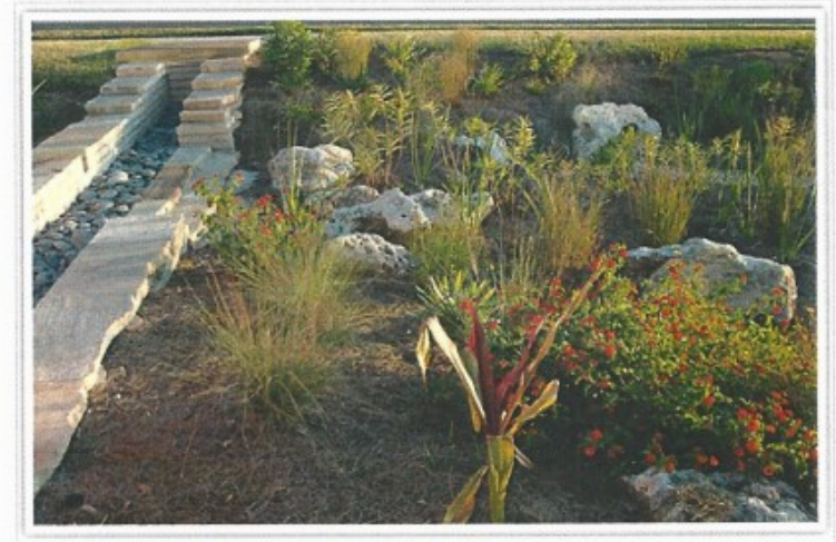
This rain garden in front of the Southwest Rec Center on the University of Florida campus is designed to capture runoff from the center's sidewalks and paved entrances.

Rain gardens work by collecting rainwater and filtering out impurities before the water returns to the aquifer.