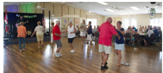
The banquet was well attended and some enjoyed dancing to Dinky's music.