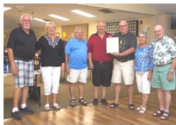
Team Wisconsin receives plaque for winning the Can-Am tournament.